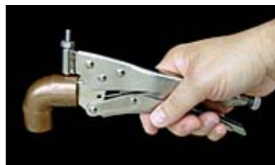
Figure 2. A solder-joint fitting modification tool, like the Brazing Dimpler™ from Brazing Dimpler Corp., is designed to hold the fitting firmly between the jaws and make a shallow impression in the fitting wall by rotating the wheel. It should only be used for joints that will be brazed.

Making Life Easier for the Brazer While Improving Joint Quality